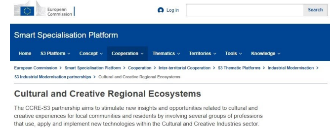
List of regions involved

https://s3platform.jrc.ec.europa.eu/cultural-and-creative-regional-ecosystems